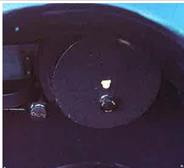
"As well as the heater finished correctly in the crackle-black (but it has lost the Smiths badge, hence the blank area in the centre)..."